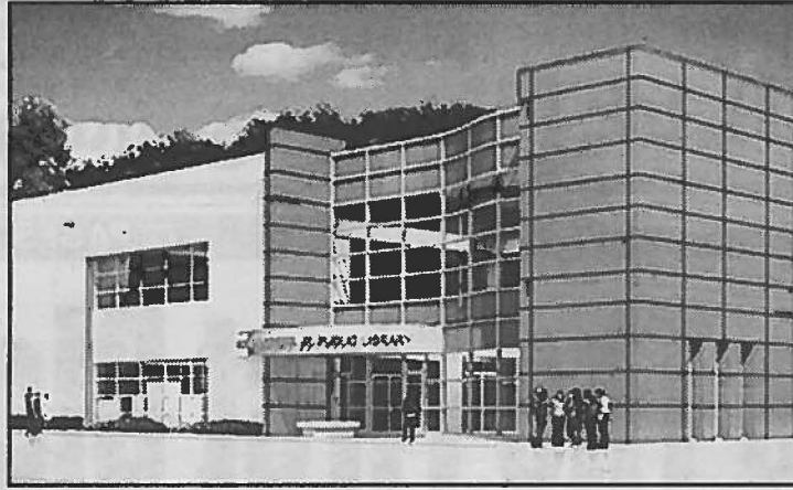
Rendering of the new C. Blythe Andrews, Jr. Branch Public Library.

One of the outstanding features of the building is that